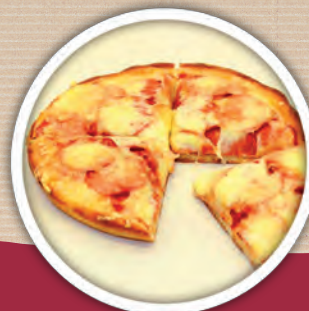
ORIGINAL CRUST PIZZA