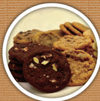
READY TO BAKE COOKIE DOUGH