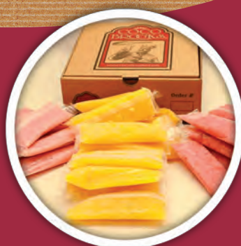
FRUIT FREEZE STICKS

✉ fundraising@cocobrooks.com ☎ (403)-250-6790 ext. 103